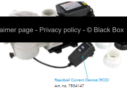
Residual Current Device (RCD) Art. no. 7534147

Poolmax pumps are specifically designed for the swimming pool domain: the Poolmax® range of pumps. Each model has been certified by an independent laboratory. Thus the Poolmax pumps have the "TDV-GS" stamp and naturally they comply with current standards for electrical wiring as well as with the new RoHS directive.